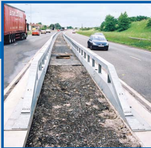
Protecting central reserves on the A38

Often used as a permanent central reservation barrier, Single Sided VARIOGUARD® is bolted at 4m centres to a concrete base approximately 450mm wide by 300mm deep, (different bolt configurations can be used for bridge decks).