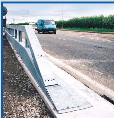
A38 narrow foot Single Sided end unit